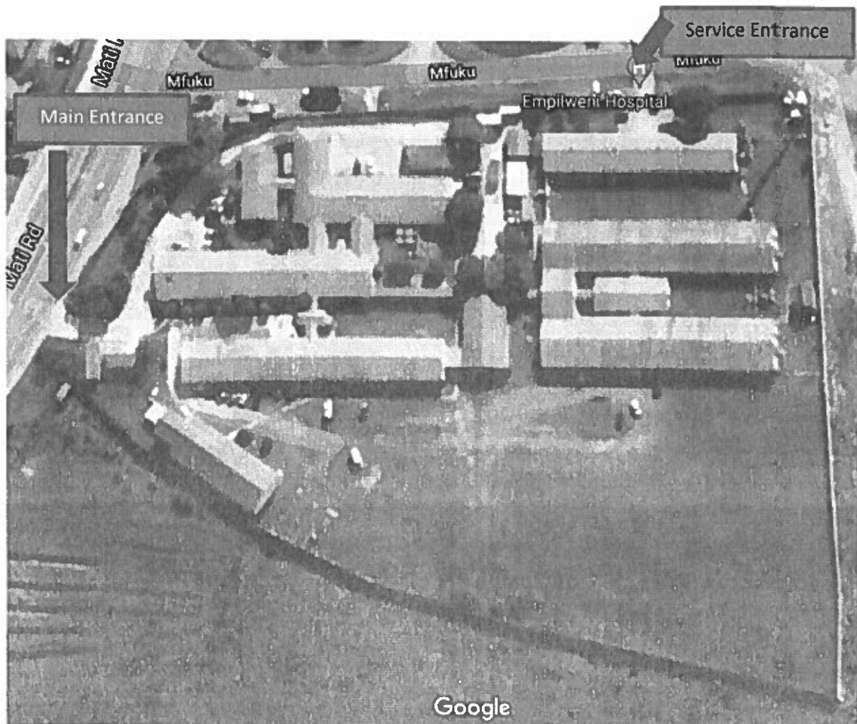
Fig. 1 Aerial photo showing entrances to Empilweni Hospital